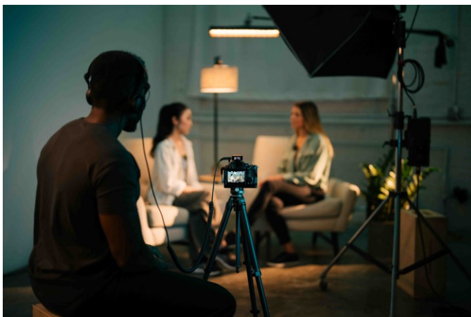
Profile Wireless used on camera in an interview scenario