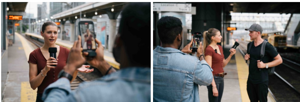
Some situations require a handheld microphone – with Profile Wireless, there is one on board

There are recording situations where a handheld microphone is an ideal choice, for example for reporter-style pieces to camera, and interviews where the creator needs more control over the conversation or is speaking with varying interviewees. For this application, the creator simply inserts a clip-on mic into the charging bar, puts the included big foam windshield on – and a fully-fledged reporter’s microphone is ready for the job.