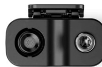
The clip-on mics of Profile Wireless feature an additional 3.5 mm (1/4”) connector for an external lav mic

When a mobile phone is used for capturing video, the Profile Wireless receiver is connected with the included Lightning or mini-USB adaptor. Thanks to a gyro-sensor, the receiver display automatically rotates by 180° to remain clearly legible.