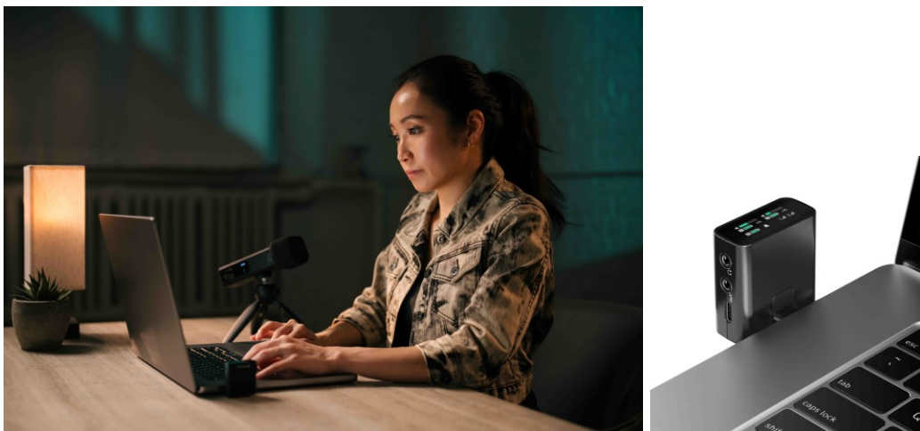
Profile Wireless used as a desktop mic, recording audio to a laptop

All Profile Wireless components come with mounting threads for standard creator’s accessories such as table stands. Thus, the system can also be conveniently used as a desktop mic.