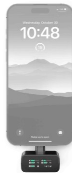
Profile Wireless used with a mobile phone to shoot vertical content